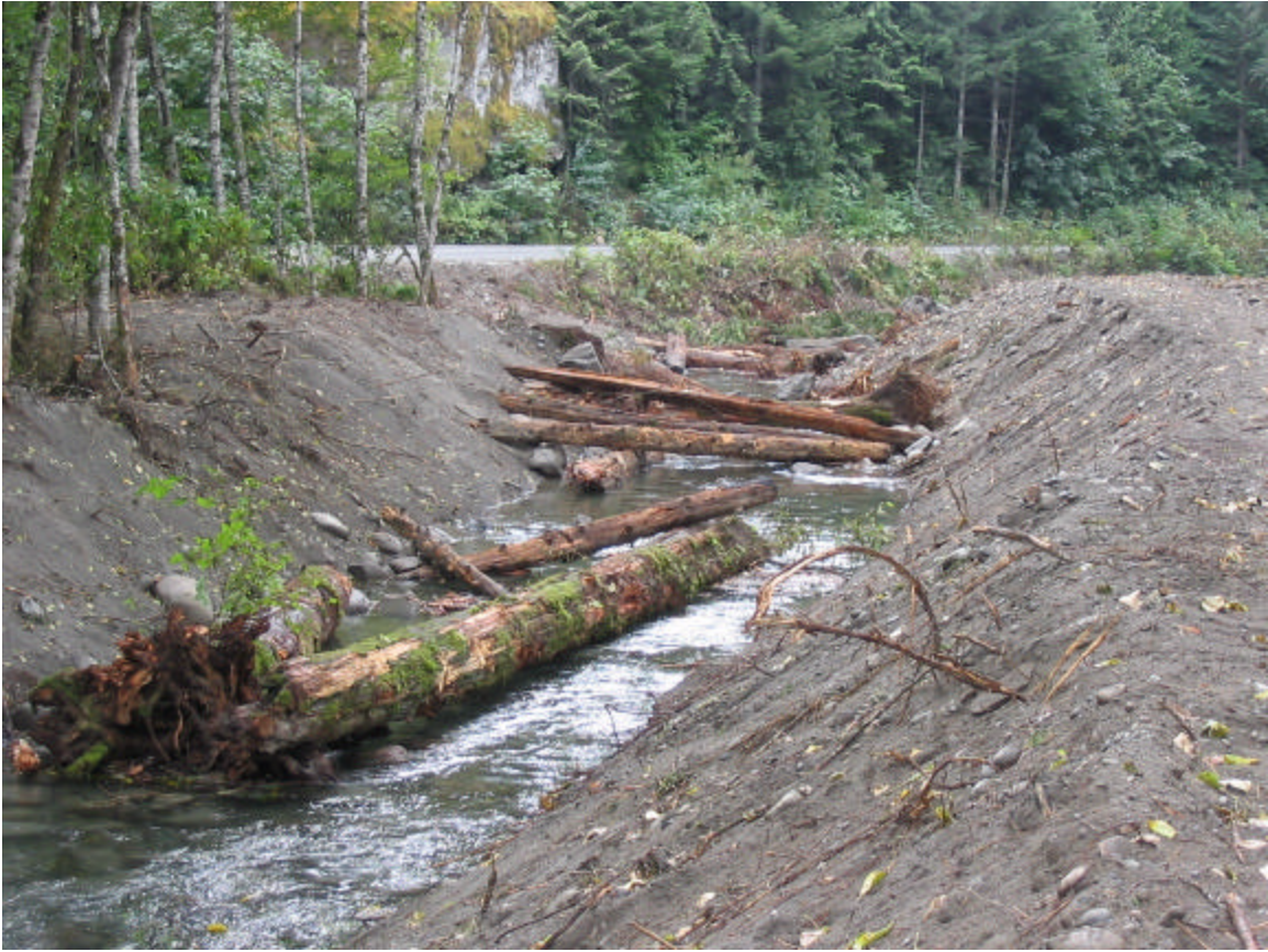
Figure 1. Freshly constructed extension channel containing boulder/LWD complexing (Aug 11/2003).